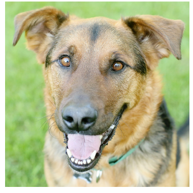
Windsor 2015 Grand Marshal